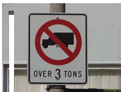
Transportation Code 501(b)